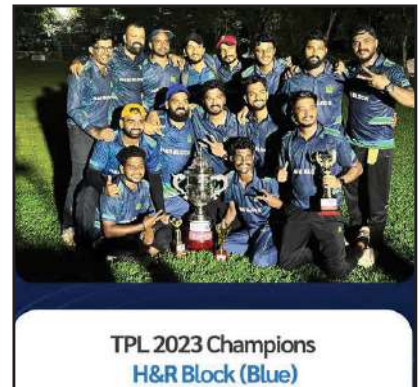
TPL 2023 Champions H&R Block (Blue)