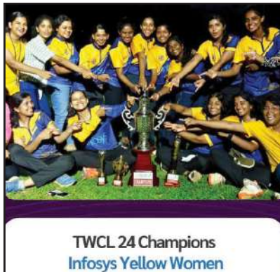
TWCL 24 Champions Infosys Yellow Women